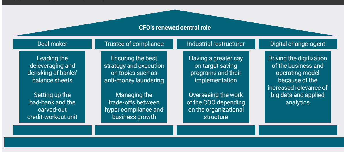
FIGURE 2: FOUR NEW CRITICAL PILLARS

The increasingly cumbersome cost structure of a bank's current operating model and the instances when chief operating officers (COOs) fail to deliver effective operational efficiency programs have led to the CFO's having greater say on target saving programs and their implementation. In some instances, the CFO and COO roles have been united or realigned so that the COO reports to the CFO.